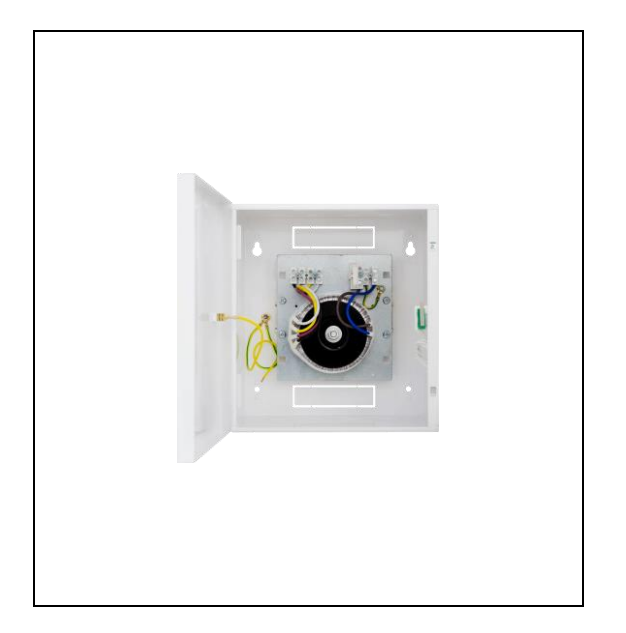
Fig. 1 Mounting configurations